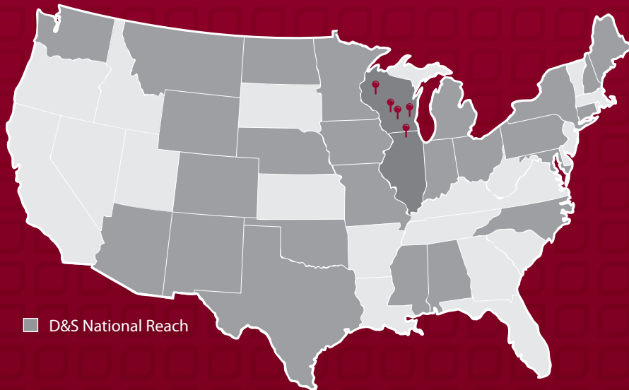
■ D&S National Reach